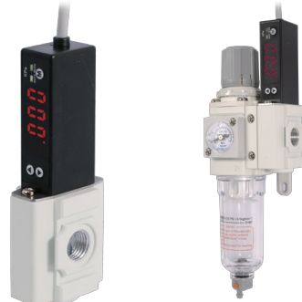
▲ Assembly example